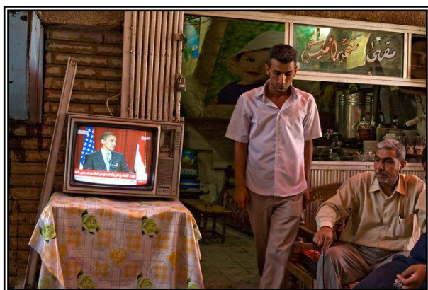
Iraqis listened to Mr. Obama's speech from Cairo in June 2009, intended to reach out to the Muslim world.

“He realizes this isn’t science, this is judgments made off of, most of the time, human intelligence,” said Mr. Daley, the former chief of staff. “The president accepts as a fact that a certain amount of screw-ups are going to happen, and to him, that calls for a more judicious process.”