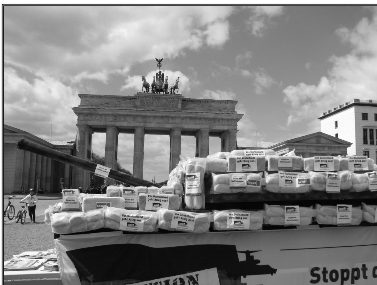
Demonstration against war “Von Deutschland geht Krieg aus“

environment and food production, which could cause... global famine affecting over a billion people.” The statement drew attention to the resolution adopted in November 2011 ↑ by the Council of Delegates of the International Red Cross and Red Crescent movement, which had emphasized that “it is difficult to envisage how any use of nuclear weapons could be compatible with the rules of international humanitarian law”. The statement insisted that all NPT parties, “especially the nuclear weapon States, [should] give increasing attention to their commitment to comply with international law and international humanitarian law.” It concluded by calling on states to “intensify their efforts to outlaw nuclear weapons and achieve a world free of nuclear weapons”.